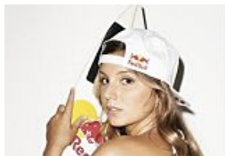
Red Bull's Athletes Bare All for the Camera