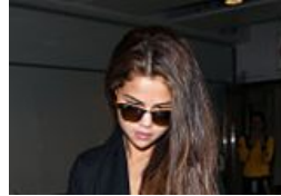
Selena Gomez Wears Impossibly Short Shorts