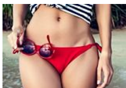
Woman Loses 37 Pounds in 9 Weeks