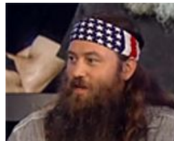
Duck Dynasty's Willie Robertson: House bid 'news to me'