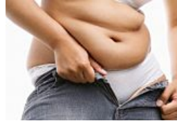
#1 Worst Fattening Food Ever - NEVER Eat THIS