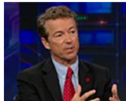
Rand Paul defends opposition to ObamaCare on 'The Daily Show'