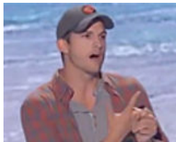
Conservatives cheer Ashton Kutcher for 'remarkable' speech at teen awards show