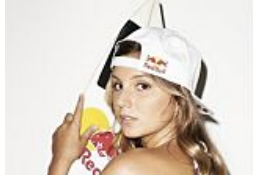
Red Bull's Athletes Bare All for the Camera