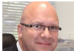
Pastor Mocked for His 'Biblical Money Code,' Gets