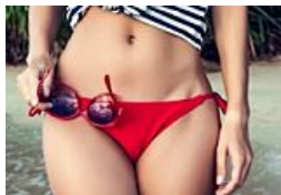
Woman Loses 37 Pounds in 9 Weeks