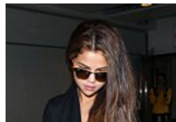
Selena Gomez Wears Impossibly Short Shorts