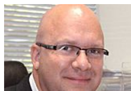
Pastor Mocked for His 'Biblical Money Code,' Gets