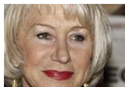
Current Hairstyles for Women Over 50 | eHow