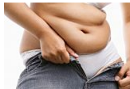
#1 Worst Fattening Food Ever - NEVER Eat THIS