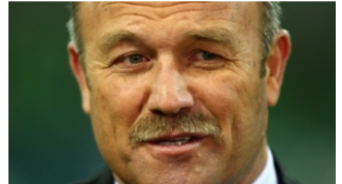
Spotlight Hour: Wally Lewis