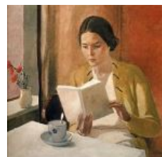
"Woman Reading" by Alexander Deyneka