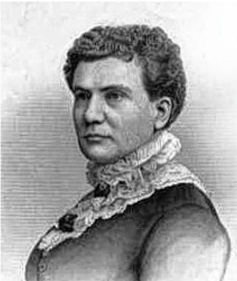
Purchase photo reprints at PhotoExtra » (http://cmonitor.mycapture.com/mycapture/remotimage.asp?