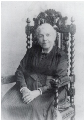
Zoom

Harriet Jacobs was an African-American writer, a former slave and abolitionist speaker and reformer.