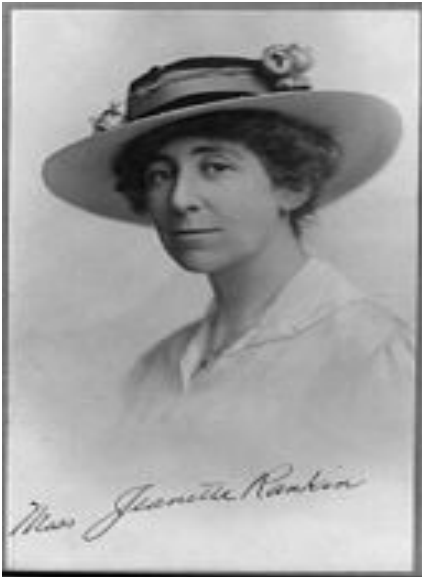
Women Candidates Made Historic Gains in Representation 2012 Election Results Heitkamp 20th woman in Senate