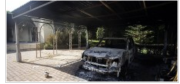
Egyptian man arrested in connection with Benghazi attack