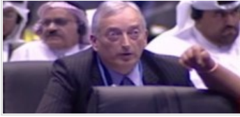
Climate change-denying English Lord crashes U.N. conference