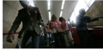
'Zombie Apocalypse' training group questions GOP senator's criticisms