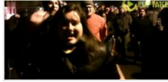
Rappers join Occupy activists in push for 'foreclosure-free zone'