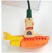
Yellow Submarine - The Beatles Christmas Light Set