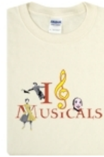
I Heart Musicals