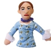
Virginia Woolf - Finger Puppet and Magnet