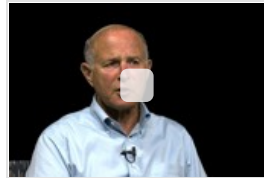
John Adams: Foreign policy