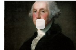
George Washington: Foreign policy