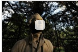
Thomas Jefferson: Foreign policy